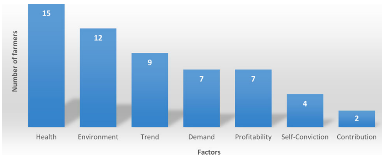
Fig. 2. Factors motivating the transition to organic farming in Lebanon (multiple answers possible).

the demand for organic products is highly driven by the health issues, the environmental complications of the alternatives and the increasing awareness tied to organic foods. Yet, organic products when available on the market are exceedingly expensive beyond the reach of low- to middle-income households; producers are unable or unwilling to lower prices. When interviewed, organic producers and sellers seem to attribute high production costs to justify the high prices of organic products in Lebanon. However, there is almost no empirical data showing the relationships between organic production costs and extreme market prices. Some leading organic growers in Lebanon also seem to attribute the high organic prices to lower yields and lack of multi-crop farms (Rahhal, 2016).