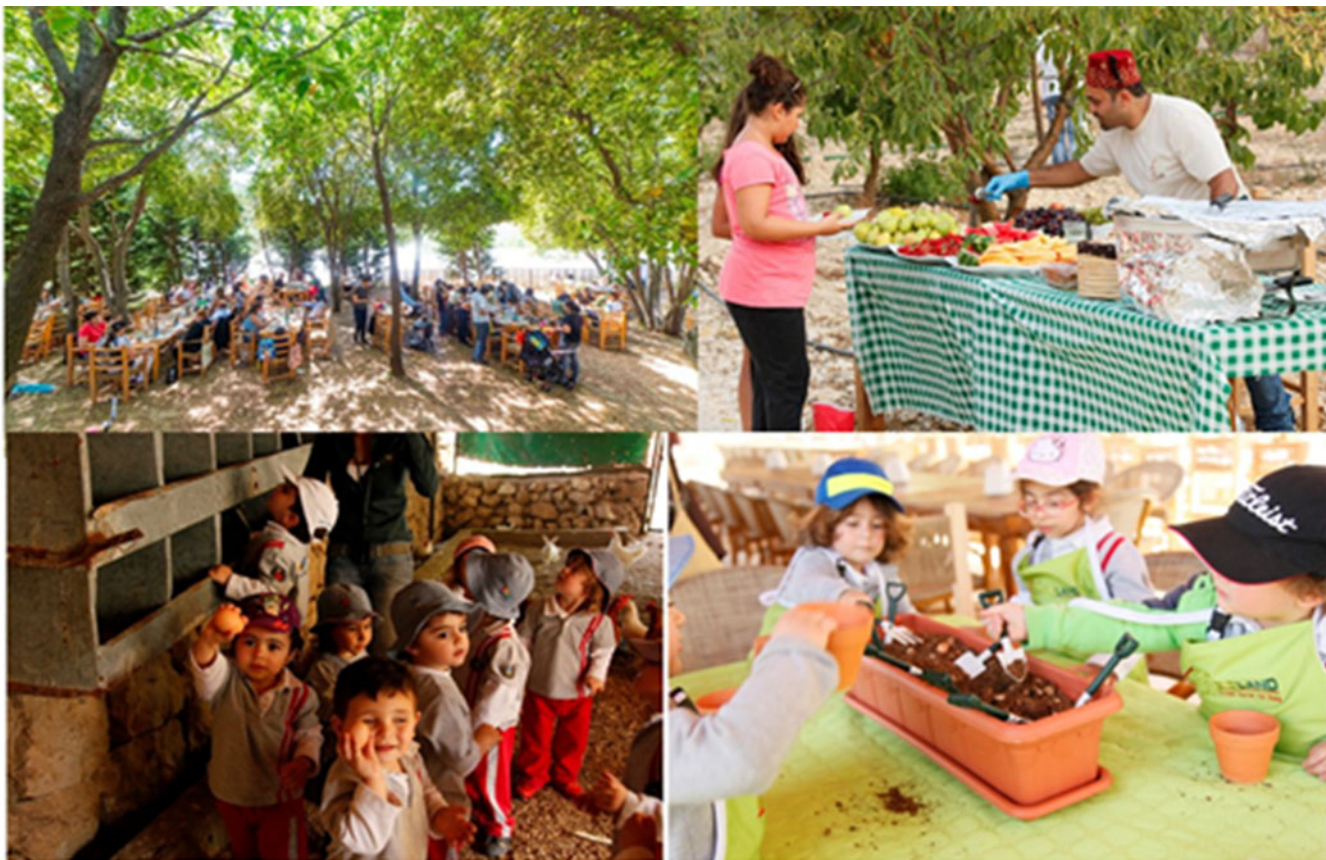
Fig. 4. Coupling agriculture to touristic activities on organic farms in Lebanon. On-farm restaurant; chef serving fresh fruits from the farm; on-farm eggs hunting and on-farm kids activity.

farm culinary and touristic activities and the sale of organic products (Fig. 4).